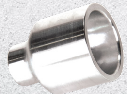
PGDMRDTSX TENT STAKE DRIVER SLEEVE